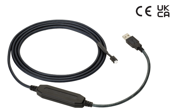
For the most recent information on models that have been certified for safety standards, refer to your OMRON website.

Easily set Temperature Controller parameters by connecting the computer's USB port and an EJ1, or an E5CN-H, E5AN-H, or E5EN-H